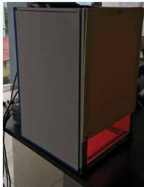
Figure 3: Funcional Prototipe

is based on calculating the thresholds in the black and white images, based on pixel density values in the images that generate the inspection, as shown in an example in Figure 4. Finally, and as option tool for discretionary use by the treating physician, an algorithm is going to be used, which aims to take pictures previously stored in a database, to be able to make comparisons with injuries previously analyzed, related or based on a method called Linear Discriminant Analysis (LDA) [10].