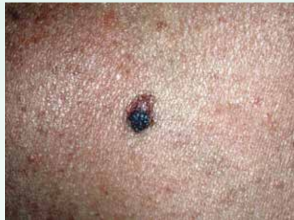
Figure 2: Uneven illumination.

As for the challenge of segmentation of images [9], the thresholding method has been selected, which