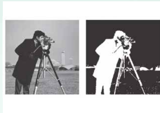
Figure 4: Thresholding method

is based on calculating the thresholds in the black and white images, based on pixel density values in the images that generate the inspection, as shown in an example in Figure 4. Finally, and as option tool for discretionary use by the treating physician, an algorithm is going to be used, which aims to take pictures previously stored in a database, to be able to make comparisons with injuries previously analyzed, related or based on a method called Linear Discriminant Analysis (LDA) [10].